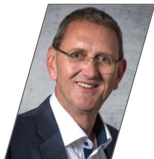
Helmut Kohl president